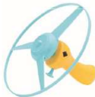
Zoom Flying Disk

For every deposit made at school students will receive a silver Dollarmites token. Once students have individually collected 10 tokens they can redeem them for exclusive School Banking reward items in recognition of their regular savings habits. There are two new items released each term so be sure to keep an eye out for them!