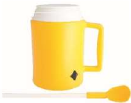
Slushie Maker Cup

Exciting new Term 4 rewards with a Super Savers theme are now available, while stocks last!