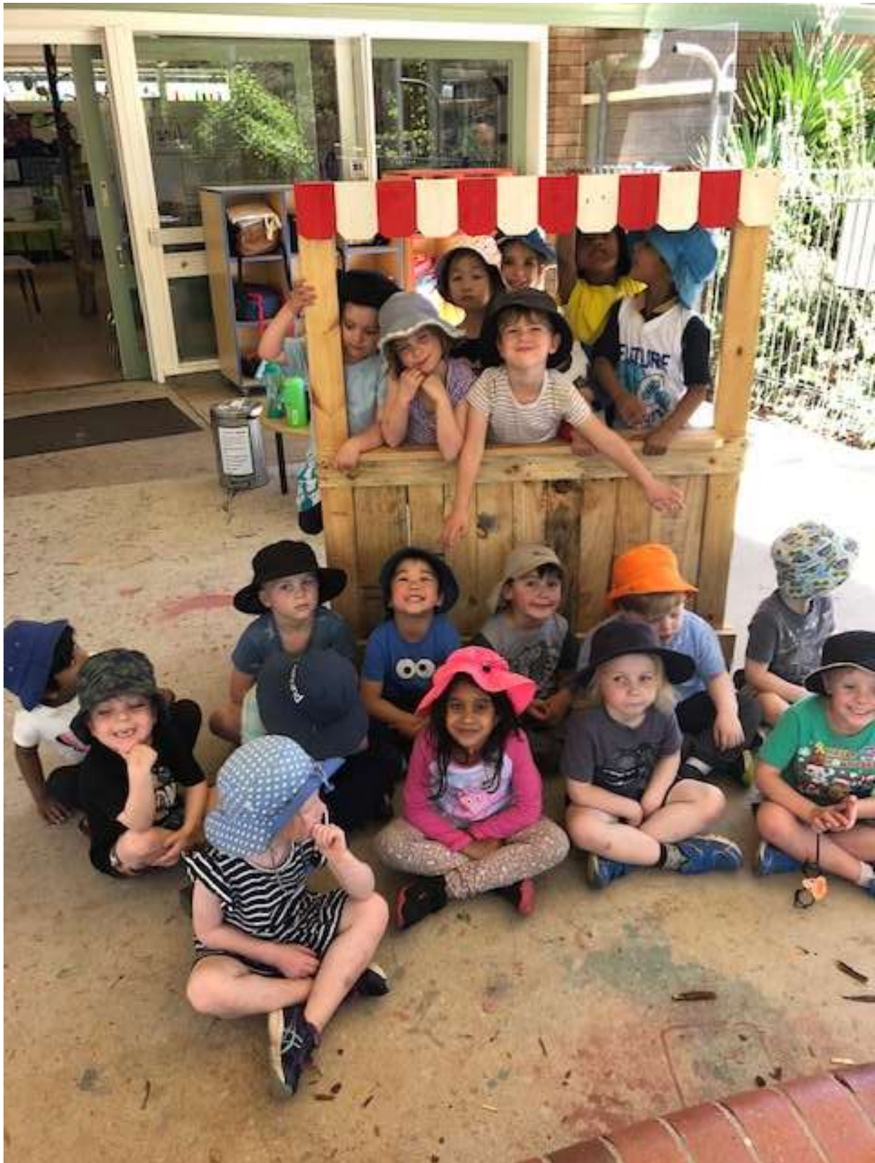
The Preschool Butterflies welcoming the arrival of the puppet theatre.